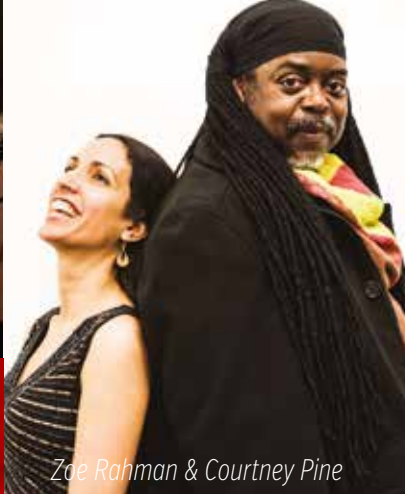
Zoe Rahman & Courtney Pine